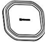
MIC protective case (X1)