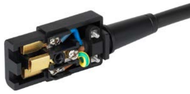
Example with assembled cable