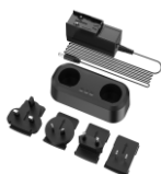
M Series Charging Base HM-5202ZC