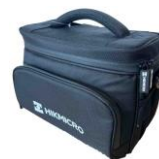
M/G/SP Series Pouch HM-SP01-POUCH

COMPLIANCE NOTICE: The thermal series products might be subject to export controls in various countries or regions, including without limitation, the United States, European Union, United Kingdom and/or other member countries of the Wassenaar Arrangement. Please consult your professional legal or compliance expert or local government authorities for any necessary export license requirements if you intend to transfer, export, re-export the thermal series products between different countries.