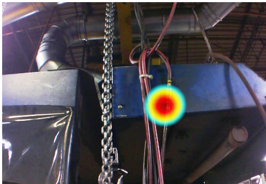
Images taken with the ii900 Sonic Industrial Imager in an industrial environment.

Fluke. Keeping your world up and running.®