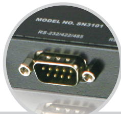
RS-232/422/485 3-in-1 serial Port