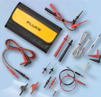
TLK287 Electronic Test Lead Kit